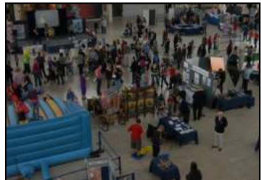
Middleton Hall, Milton Keynes

For the second year the Brickhills Rotary Club had a VERY successful day. Although there were fewer stands but still well supported by our Clubs as well as by District 1070 – Northampton/Bedford area. It was announced on local radio early in the morning which generated a few more shoppers.