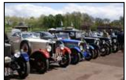
MG's on display at the Royal Windsor MG Heritage Festival

The event raised money for the Prince Philip Trust Fund and Rotary International and was organised by The Rotary Club of Windsor and Eton.