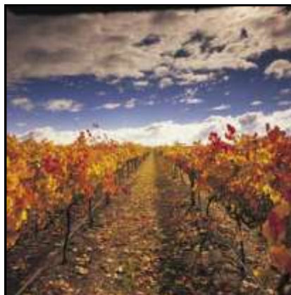
Yarra Valley Vineyard, Victoria

the Atlantic Islands, a spectacular area, probably for spring 2010. We have room for 1 or 2 more couples