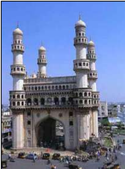
The Charminar, Hyderabad

Hyderabad & Secunderabad are the twin cities and familiarly known as Greater Hyderabad is the capital city of the Indian state of Andhra Pradesh. This high-tech city has a population of 6.7 million, is the second largest (in terms of area) in the country. Hyderabad is known for its rich history, ancient civilization and architecture representing its unique character as a meeting point for North and South India, and its multilingual culture, both geographically and culturally. Endearingly called the Pearl City and the City of Nizams, Hyderabad is today one of the most developed cities in the country and a modern hub of Information Technology, IT Enabled Services and Biotechnology.