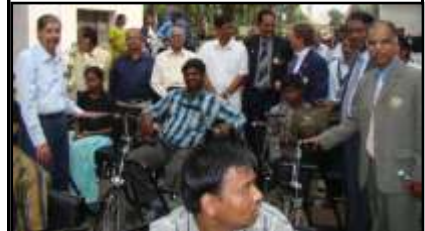
Imparting dignity to the physically disabled

Community Service Activities: Such as distribution of food relief kits, tri-cycles for physically challenged, notebooks to students, saplings and school benches. The Club has recently under-