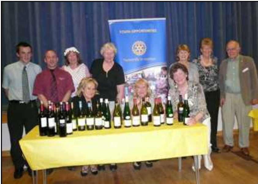
Members of Wendover Rotary Club pictured at their first fund raising event, a cheese and wine tasting organised in conjunction with Messrs Waitrose

The new emerging Club at Wendover held their first fund raising event on 20 th May, when they organized a Wine and Cheese tasting at the Memorial Hall in Wendover. The wines and cheeses were kindly provided by Waitrose and members of their staff talked about the samples offered.