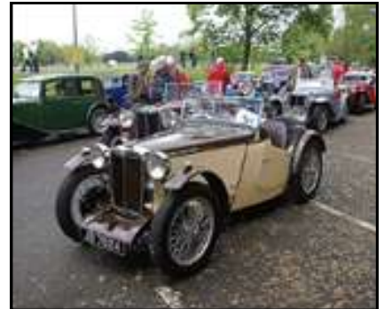
An MG on display at the Royal Windsor MG Heritage Festival

More than 250 MG sports cars took part in a rally at Windsor Castle attended by the Duke of Edinburgh.