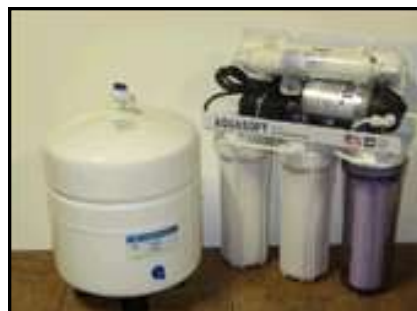
Typical reverse osmosis equipment

These community development projects launched on 12th March, 2009 offer pure & protected drinking water to the school children and the villagers thus keeping them free from diseases that occur by fluoride.