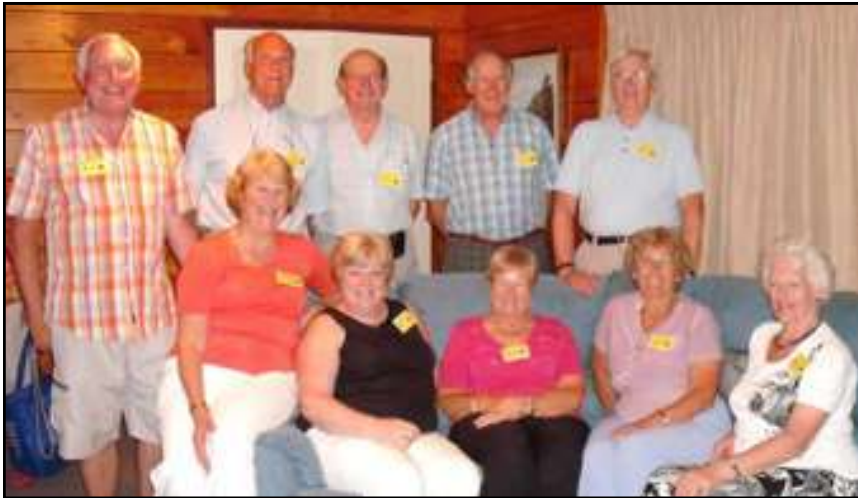
Happy Rotarians enjoying their Friendship Exchange in New Zealand

Yes – we're back from New Zealand , very tanned and happy, after meeting wonderful fellow Rotarians in another country, and hence making new friends and learning about other ways of life, all in the context of our magnificent international movement. We were hosted by 5 clubs, saw beautiful countryside, and visited every possible attraction, from THE Maori celebration to the main oil refinery and several boat trips and BBQs.