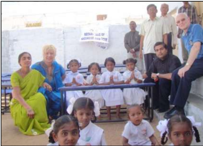
The Club provides school benches