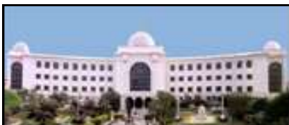
The Salarjung Museum, one of the seven wonders of Hyderabad

Hyderabad & Secunderabad are the twin cities and familiarly known as Greater Hyderabad is the capital city of the Indian state of Andhra Pradesh. This high-tech city has a population of 6.7 million, is the second largest (in terms of area) in the country. Hyderabad is known for its rich history, ancient civilization and architecture representing its unique character as a meeting point for North and South India, and its multilingual culture, both geographically and culturally. Endearingly called the Pearl City and the City of Nizams, Hyderabad is today one of the most developed cities in the country and a modern hub of Information Technology, IT Enabled Services and Biotechnology.