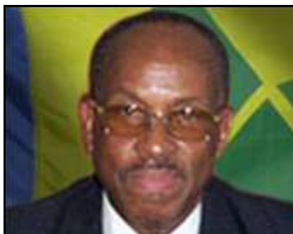
The Hon Sir Louis Straker, Deputy Prime Minister and Foreign Minister of St Vincent and the Grenadines

"The Minister wished me to thank the Club and the Rotary Foundation for the interest we are taking in his country. He said we would be putting smiles on the faces of some very needy people, and changing their lives too. We can be proud of what you are doing."