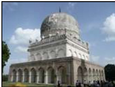
Qutb Shahi Tombs

More info about this 400 year old city at: http://www.hyderabad.org.uk